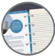
Full color insert pages