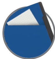
Colored divider with pocket